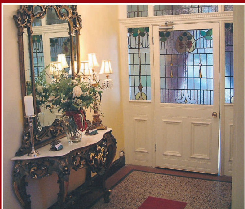
• Entrance hallway at Innisfree House.

The focus is on achieving an authentic Edwardian experience for our guests